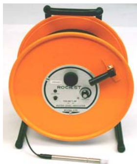
Figure 1: Model CPR water level indicator