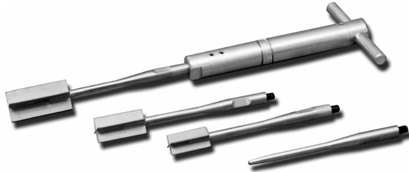
Figure 1: H-60 vanes in three different sizes

When different sizes of vanes are used, the instrument range is from 0 to 260 kPa. The accuracy of the instrument should be within 10% of the reading.