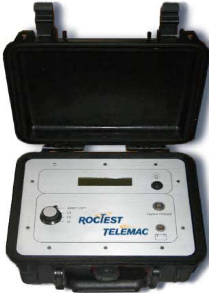
FIGURE 1: FC-5 Readout Unit.

The FC-5 readout is a durable, self-powered, portable unit; it is designed to read inductive sensors. The front panel has various options and control devices (knobs, switches, a crystal liquid display). The readout unit is provided with an external charger for charging the battery. A measurement wire makes it possible to be connected on a sensor or a switching unit.